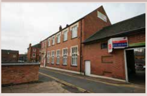
Re-purchase of the former parish hall as part of a larger building project at the church

The solar panel project will support the long term viability of the premises and of the congregation's mission and vision in this rural town."